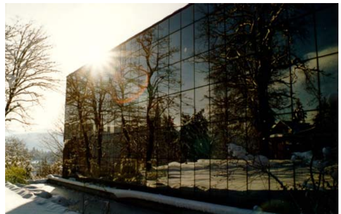
UNIQUARE Headquarters Krumpendorf/Wörthersee